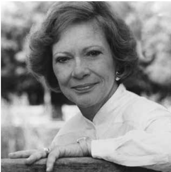
ABOVE: Former First Lady Rosalynn Carter

Former First Lady Rosalynn Carter Receives Honorary Tribute